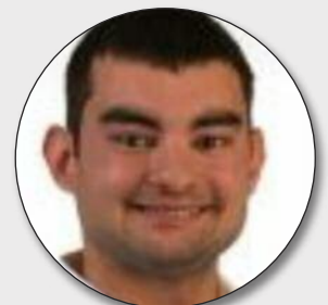
JOHN DEROSIER, Press of Atlantic City