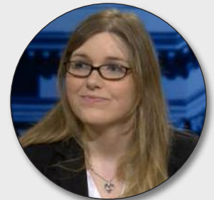
JILL COLVIN, AP