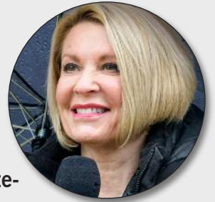
BRENDA FLANAGAN, NJTV

Top notch pro covers Statehouse and street politics for NJTV. Tenacious? Flanagan's the kind of reporter who shows up in a driving, state-debilitating snowstorm to tackle a disguised politician on the tarmac of Newark Airport before he can get out of town on that flight to Miami.