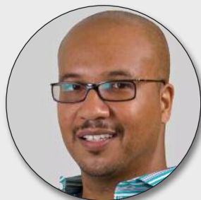
LEVON PUTNEY, WCBS News Radio 880