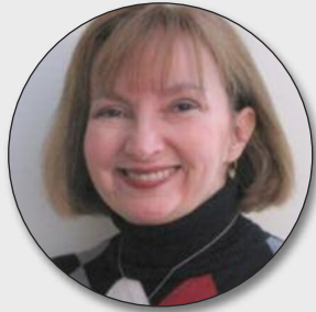
COLLEEN O'DEA, NJ Spotlight