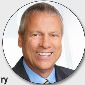
BRIAN THOMPSON, NBC 4

The NBC News 4 vet still snags the big stories, and will forever live in the annals of New Jersey politics as that extraordinary inquisitor during the 2004 U.S. Senate contest.